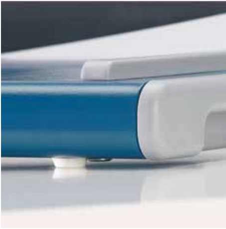
Non-slip rubber feet for firm standing